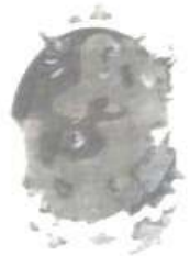
more polluting our world every day